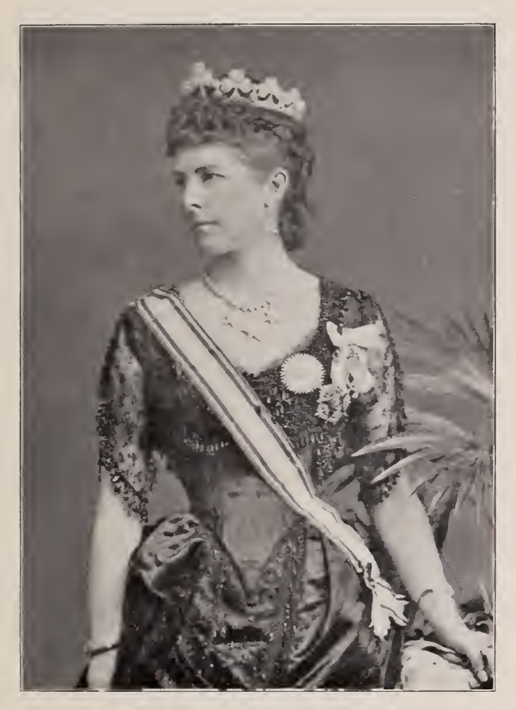
Her Excellency the Countess of Dufferin